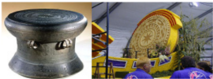
Decorative motifs of Đông Sơn bronze drums

Over the history of Vietnam, the land next assumed the names of Giao Chỉ, Giao Châu or An Nam (Pacified South) under Chinese rule. Queen Trưng Nữ Vương did not chose a name for the country, but subsequent Vietnamese Kings named their independent state Vạn Xuân (10,000 Springs, 544-602), Đại Cồ Việt (Great Great Viet 967-1009), Đại Việt (Great Viet 1010-1400), Đại Ngu for seven years under Hồ Quý Ly 53 , and Đại Việt again under Lê Lợi in 1428.