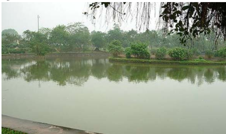
Lake Giếng Ngọc or Ngọc Tinh, Pearl Well.

Trọng Thủy, following the scattered white feathers, soon reached the end of the trail to find the lifeless princess. He took her body back to the capital Cổ Loa and buried her with all the pomp and dignity due to a princess. Inconsolable, he sat for days by the well where she used to wash her hair. One day, looking into the well, he saw her face at the bottom and jumped in to rejoin her, ending his life. Ever since, if a South Sea pearl is rinsed with water from the well, its luster shines brighter. The well still exists today. When you pass by Cổ Loa, don’t forget to visit the romantic Giếng Ngọc, Pearl Well.